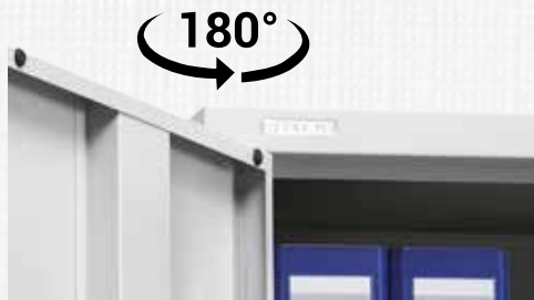
180° Opening Metal Hinges Doors