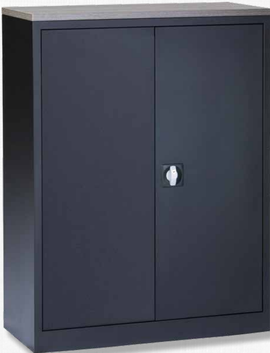
🔍 12 131