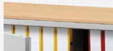
18 mm Wood Top Option