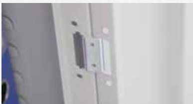
180° Opening Metal Hinges