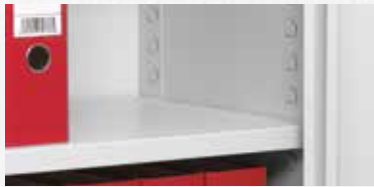
Height Adjustable Shelves