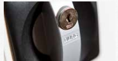
BURG | Square Handle Lock With Two Point Espagnolet Locking System