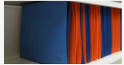
Shelf with Suspended Filing