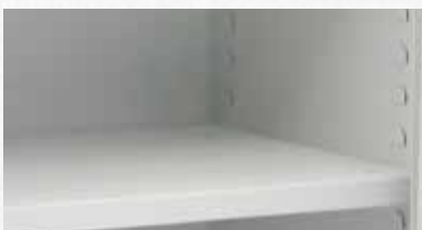
Height Adjustable Shelves with Increment of 36 mm