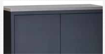
Wood Top Option