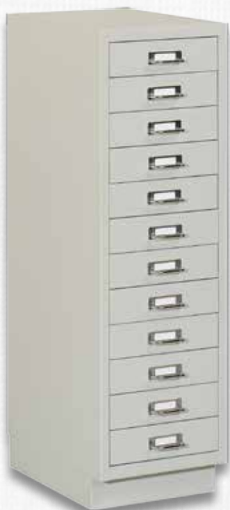
🔍 53 325