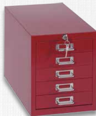
🔍 53 321