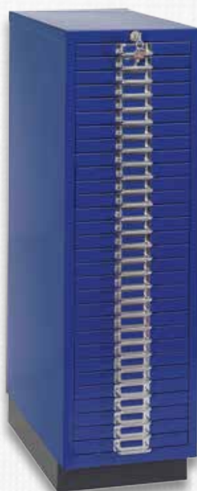
🔍 53 326