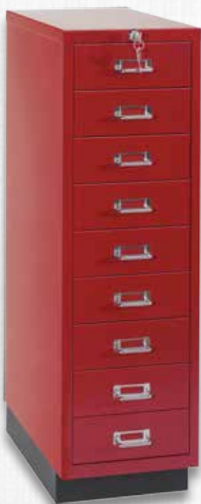
🔍 53 324