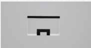
Name Label Holders on the Doors