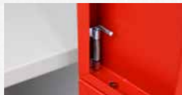
Spring Hinges Doors