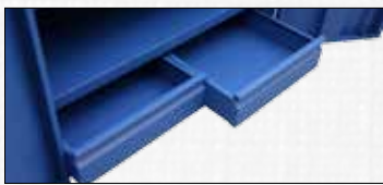
Optional Drawers Inside the Cabinet