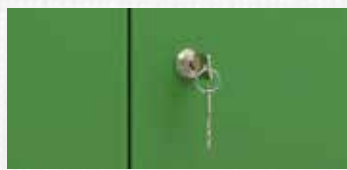
BURG | Cylinder Lock