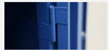
Metal Hinges with 180° Opening